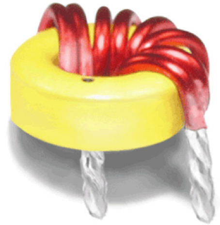
Fig. 1a. Wound toroid inductors were mainstay of desktop voltage regulators.

Tests have been done to compare the power cube's performance to the power bead's.