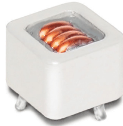
Fig. 1b. The through-hole power cube is an alternative to the wound toroid inductor.