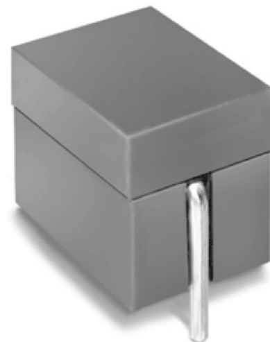
Fig. 1c. The power bead is another approach to the wound toroid inductor design.